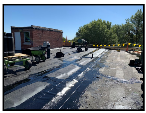
<u>Dieterich Hall</u> <u>Roof Repairs</u>