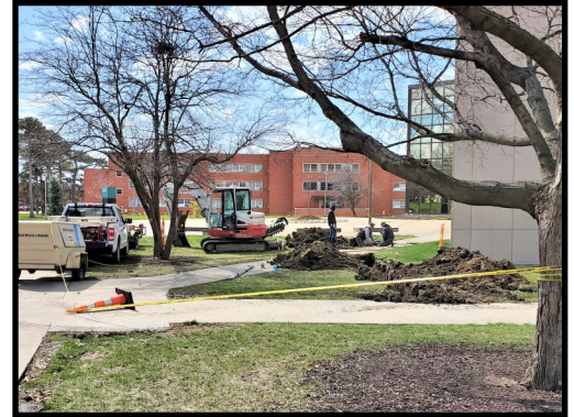
Owens Lighting Repairs