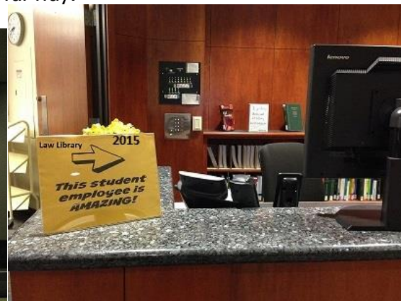
*Example photos from other institutions