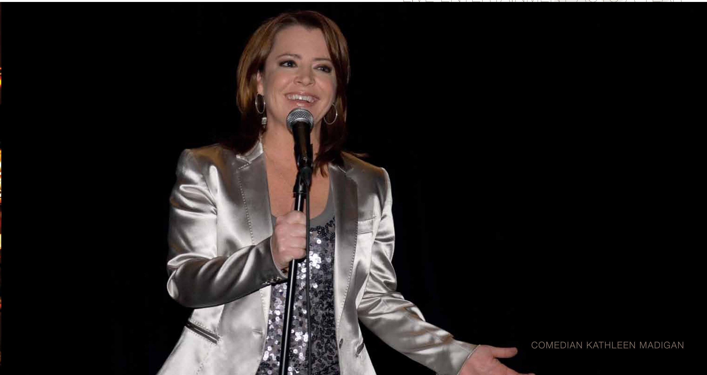
COMEDIAN KATHLEEN MADIGAN