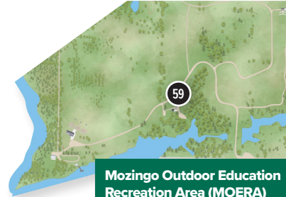
Mzingo Outdoor Education Recreation Area (MOERA) Take U.S. Hwy 136 east to Mzingo Lake Recreation Park