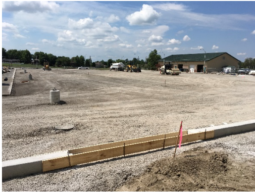
South Parking Lot