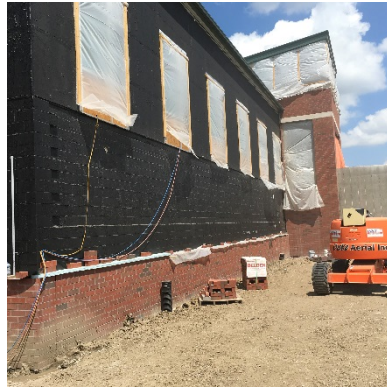
Support Bar (south)