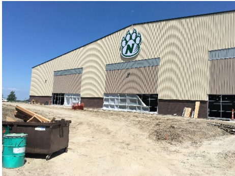
Progress – South Elevation