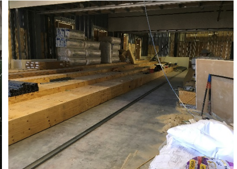
Progress – Tiered Classroom

Project Scope: 137,250 gross square foot pre-engineered metal building including a 150 person, tiered meeting space that can be sub-dividable into 50 person capacity meeting spaces. Concessions, ticketing, public restrooms and 350 retractable spectator seats are proposed. A 300 meter synthetic surface with six, 42 inch wide running lanes and eight, 42 inch wide sprint lanes, an approximately 100 yard synthetic grass infield surface, two sand pit areas used for track jumping events, a synthetic surface high jump area and two pole vault stations, two batting cages for baseball, two batting cages for softball and four practice tennis courts.