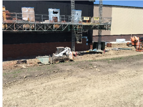
Progress – Support Bar