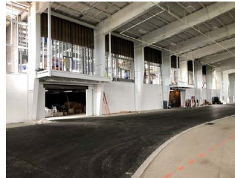
Progress – Support Bar