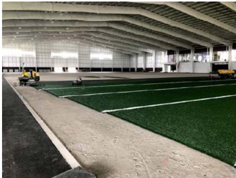
Progress – Overall Interior