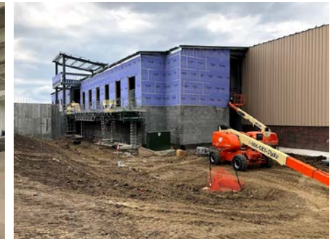
Progress – Support Bar

Project Scope: 137,250 gross square foot pre-engineered metal building including a 150 person, tiered meeting space that can be sub-dividable into 50 person capacity meeting spaces. Concessions, ticketing, public restrooms and 500 retractable spectator seats are proposed. A 300 meter synthetic surface with six, 42 inch wide running lanes and eight, 42 inch wide print lanes, an approximately 100 yard synthetic grass infield surface, a separated weight throw area, two sand pit areas used for track jumping events, a synthetic surface high jump area and two pole vault stations, three batting cages for baseball, three batting cages for softball and four practice tennis courts.