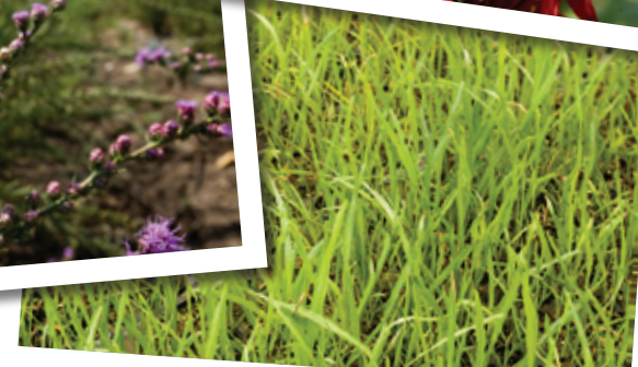
The button blazingstar, cardinal flower and prairie cord grass are among the more than 300 species of native grasses and wildflowers grown at Allendan Seed.