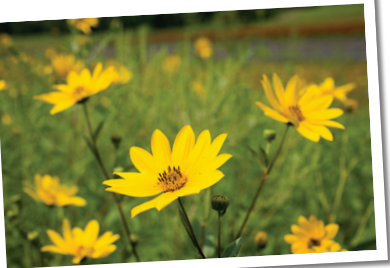
The bright color and hardiness of the early sunflower make it a popular variety.

Allendan Seed has about 50 employees, many whom are seasonal migrant workers, as well as the Allen's four grown children who returned to the family business