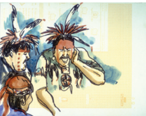
"Badger Wahwasuck Singing and Drumming," Marker/Watercolor, 2007