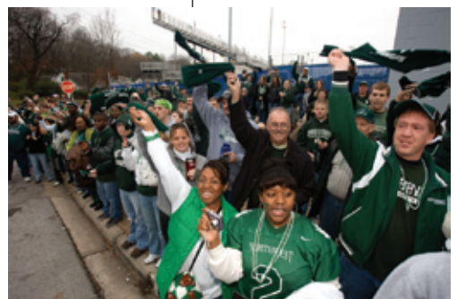
Thousands of enthusiastic fans traveled to Florence, Ala., to support the Bearcats at the NCAA Division II National Championship.