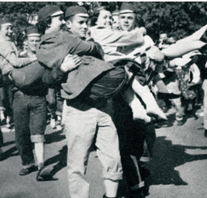
Sporting green beanies as a sign of their freshman status, students obediently rolled up a pant leg and carried a freshman girl on Walkout Day in the late 1950s. Walkout Day signaled the end of having to wear the beanies, which were abolished in 1962.