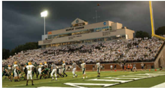
With new lights and FieldTurf added this season, Bearcat Stadium, which includes Mel Tjeerdma Field, is one of the nation's most elite venues in Division II football.

other "Bearcats." The visiting team knows whose turf they've stepped onto. Perhaps it's why Northwest has won 16 straight home games.