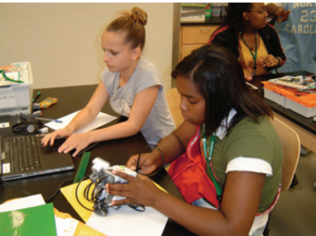
As part of Challenge U, a program Northwest created in cooperation with the Ewing Marion Kauffman Foundation, inner city youth spent time on the Northwest campus this summer studying epidemiology, robotics and rockets.

“We need to invest in these kids in order to get a return,” she said. “Our future relies on them.” ■