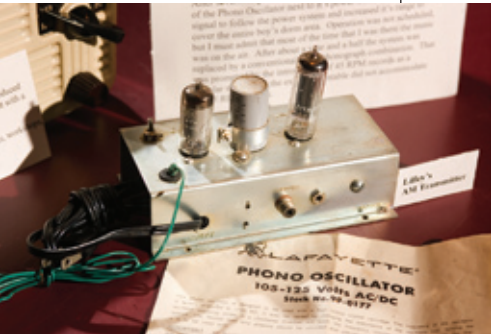
The phono oscillator used by Roy Lilley in the 1940s is on display in Northwest's Warren Stucki Museum of Broadcasting.