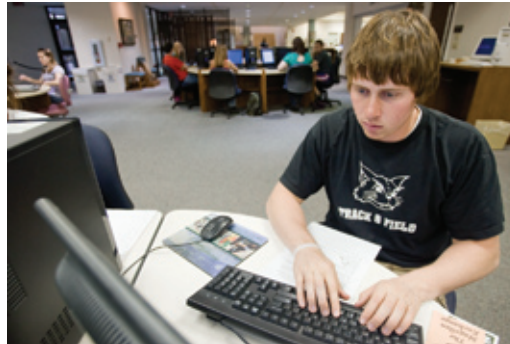
The University's B.D. Owens Library is frequented by many student-athletes, one of the many factors that contribute to Northwest being recognized by the Collegiate Power Rankings.

importance on winning games but on academics and graduating players as well." ■