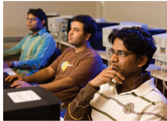
The Society of International Ambassadors Scholarship will financially assist Northwest's undergraduate international students more than ever before.