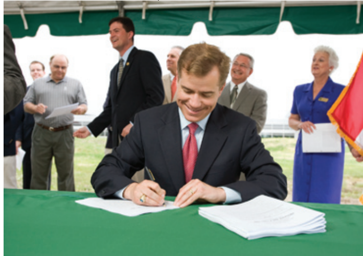
Gov. Matt Blunt smiles as he signs omnibus higher education legislation on the Northwest campus. Among other things, the bill provides $24.4 million for the University's Center of Excellence.

Blunt said the funding plan will "put higher education in reach for more Missouri families than at any other point in our state's history" by increasing funding for state-assisted colleges and universities, stabilizing tuition and adding scholarships that will "open the door for thousands of students in Maryville and across the state." ■