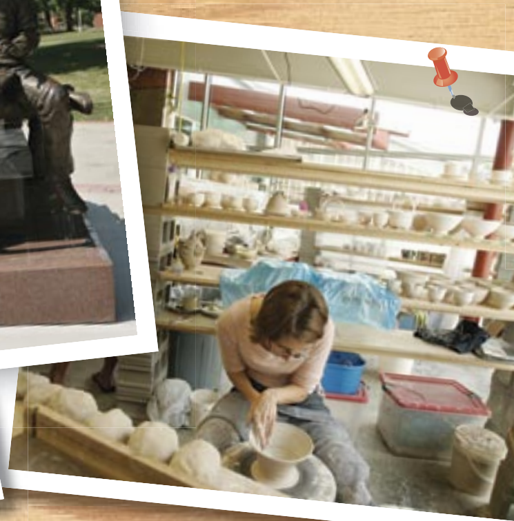
From left: The Centennial Garden, installing the centennial sculpture, the Fire Arts Building being put to good use