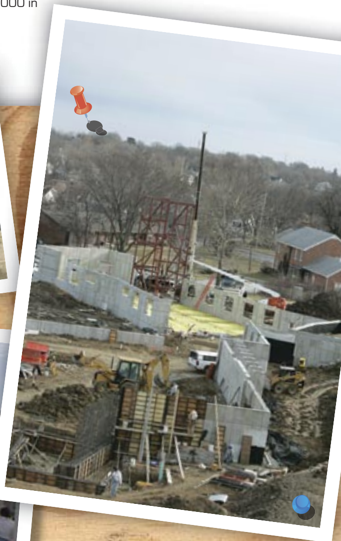
Clockwise: College Park Pavilion, re-construction of Hudson and Perrin halls into freshman suites, the International Plaza's flag-raising ceremony