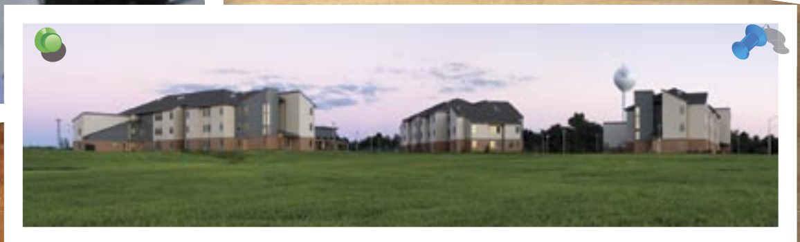
Clockwise: Bearcat Stadium, The Station, Forest Village Apartments