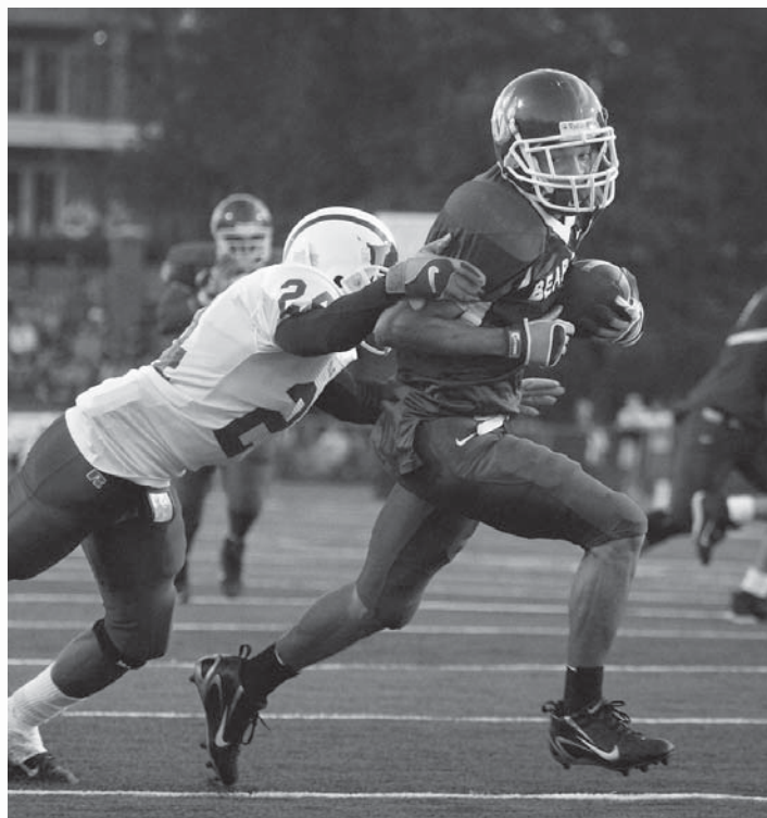
Meet the Bearcats