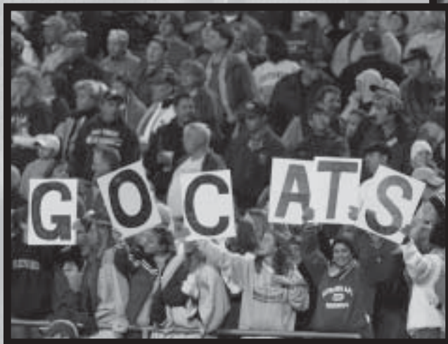
A record 26,695 fans saw Northwest totally dominate Pitt State at Clash of the Champions.