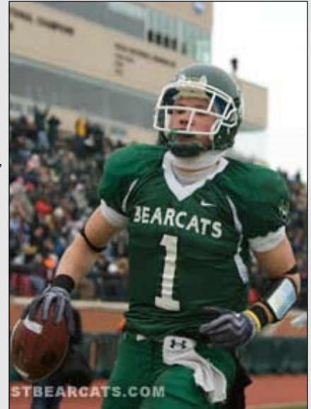
Northwest takes its six-game winning streak to Emporia State Saturday where the Bearcats haven't lost since 1965.