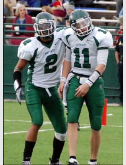
Northwest and Abilene Christian kick off the 2009 season Thursday at Shotwell Stadium before a nationwide audience on CBS College Sports.