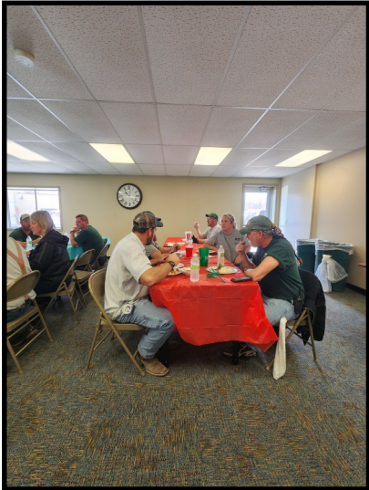
Facility Services Potluck