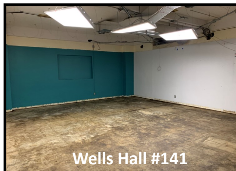
Wells Hall #141