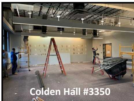
Colden Hall #3350