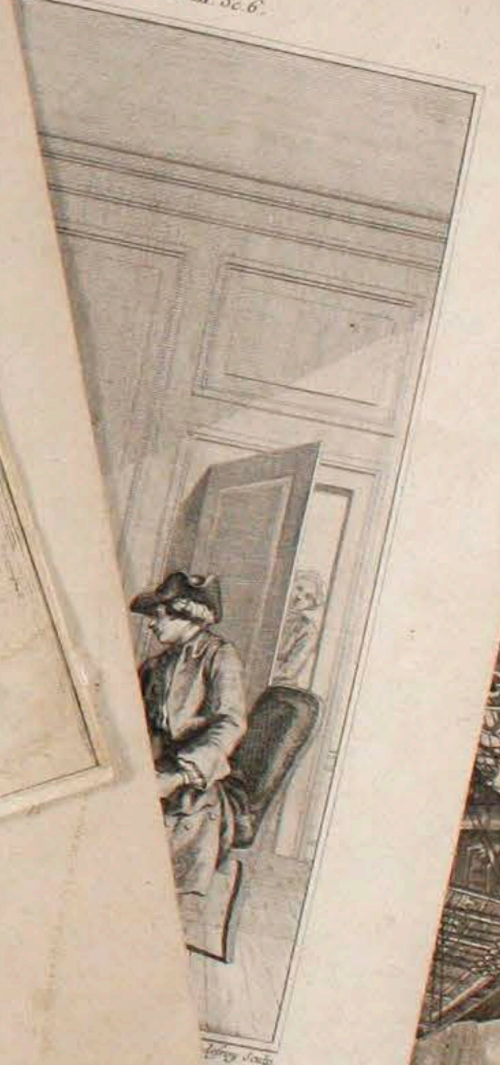
L'ECOSSAISE, Act III. Sc. 6.