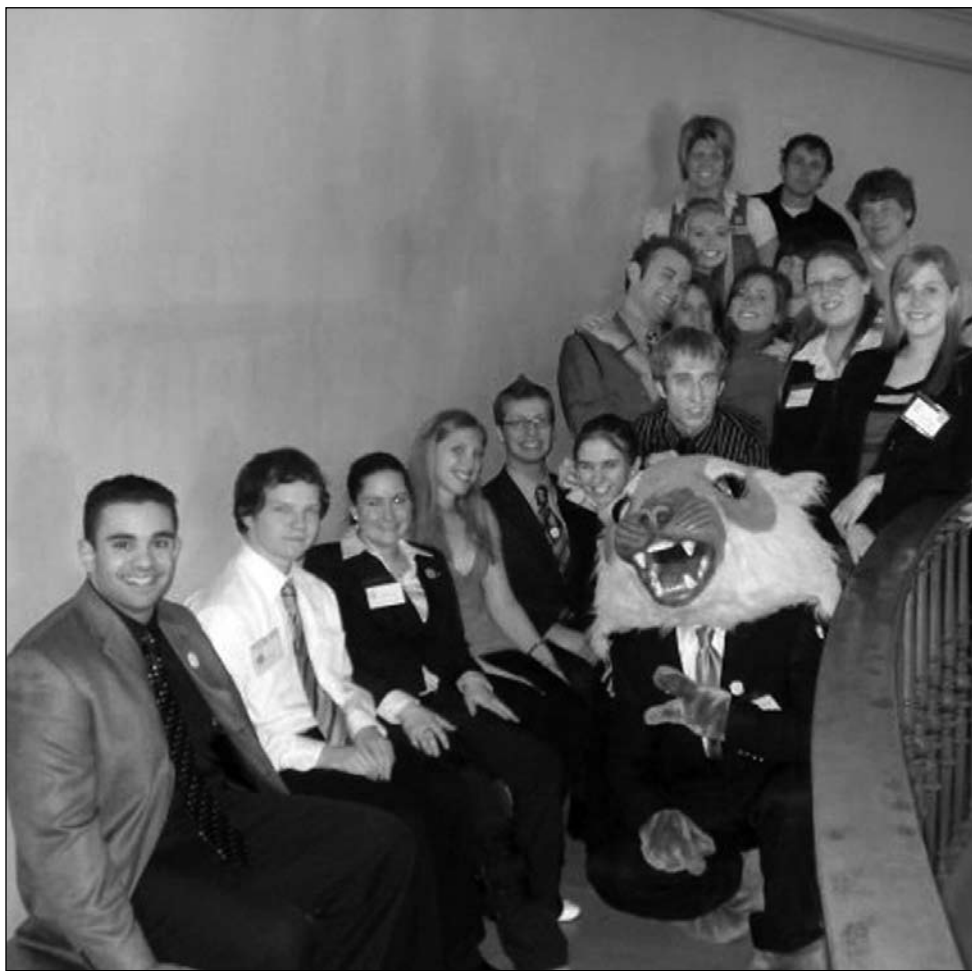
Northwest students and Bobby Bearcat at the State Capitol.